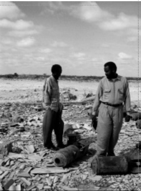
A legacy of conflict in Somalia - unexploded ordnance near Galkayo, where the Somali NGO, Environment and Community Development Organization, has carried out some demining.

Somalia has an estimated 1-2 million landmines and unexploded ordnance (bombs, shells etc.), much of which is in Somaliland and, to a lesser extent, Puntland. Surveying and demining has begun in a few locations with UNDP support, but there seem to be few donors interested in supporting this work in Somalia. How is it that Somalia is receiving only a tiny fraction of the investment in demining that other countries (e.g. Bosnia) have received. Both Puntland and Somaliland have publicly endorsed the Landmines Treaty, but as they are not permitted to sign it their commitment goes unrecognized and, seemingly, unrewarded.