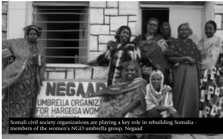
Somali civil society organizations are playing a key role in rebuilding Somalia - members of the women's NGO umbrella group, Negaad

Outstanding in the NGO sector are women's organizations. Many would argue that women are the pioneers for peace and development in Somalia. It is therefore essential that Somali women's NGOs and women politicians and activists be supported by both the local and international communities. There are no women representatives in the Somaliland Parliament at present and, although Puntland has taken a lead in this respect with five women parliamentarians, they remain isolated and their voices are not adequately recognized.