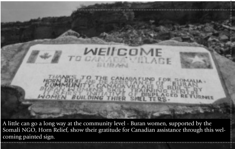
A little can go a long way at the community level - Buran women, supported by the Somali NGO, Horn Relief, show their gratitude for Canadian assistance through this welcoming painted sign.

the very positive developments in Somaliland and Puntland and the impact this is having on other parts of Somalia. This report urges that this process be accelerated and that a pro-active and pragmatic approach be taken. Somalia should be treated as a special case. In particular, we call upon civil society organizations to lead the way and establish partnership linkages. The Somalia quarantine must be lifted forthwith.